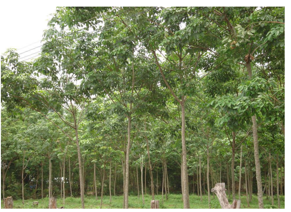
Progressive farmers plant long-term crops like rubber.