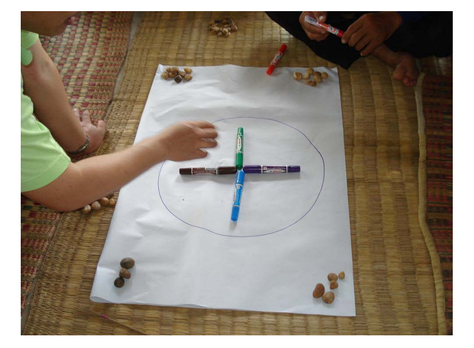
"Income and livelihood are our main problems in the community. Health is also a problem."

Using the chapatti pie, the men showed that dengue is most serious among other health issues.